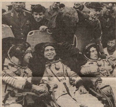
I cosmonauti della Mir. A destra Sergel Krikalev, prigioniero dello spazio da maggio

agosto aveva rimesso tutto in discussione. Superati i giorni del golpe le vecchie strutture di gestione erano entrate in crisi. Le basi spaziali erano distribuite tra la Russia e il Kazakistan da dove partono e arrivano i cosmonauti e il Kazakistan decise di nazionalizzare tutti gli impianti. Ma si trattava di una decisione senza conseguenze perché, in realtà, tutte le basi erano gestite dai militari che mantenevano il controllo. Il lancio dei vetri, tuttavia, era solo un aspetto delle missioni spaziali alle quali contribuivano, per quanto riguarda le navicelle, i centri di produzione dislocati intorno a Mosca. E furono soprattutto questi a non essere più in grado di fornire astronauti e apparati.