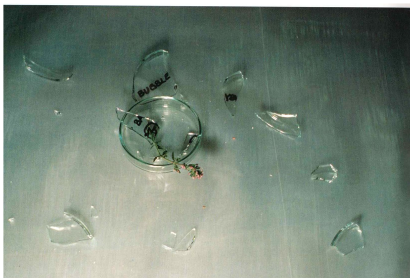
9 Grazia Toderi, Bubble Baby , 1992, photographic paper on aluminum, 50 x 75 cm.