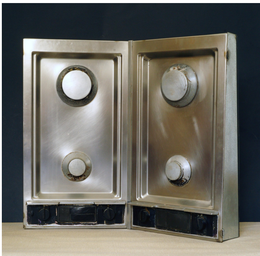
11 Mirella Bentivoglio, Cucinare parole (Cooking Words), 1995, ready made, 58 x 51, 5 x 20 cm.