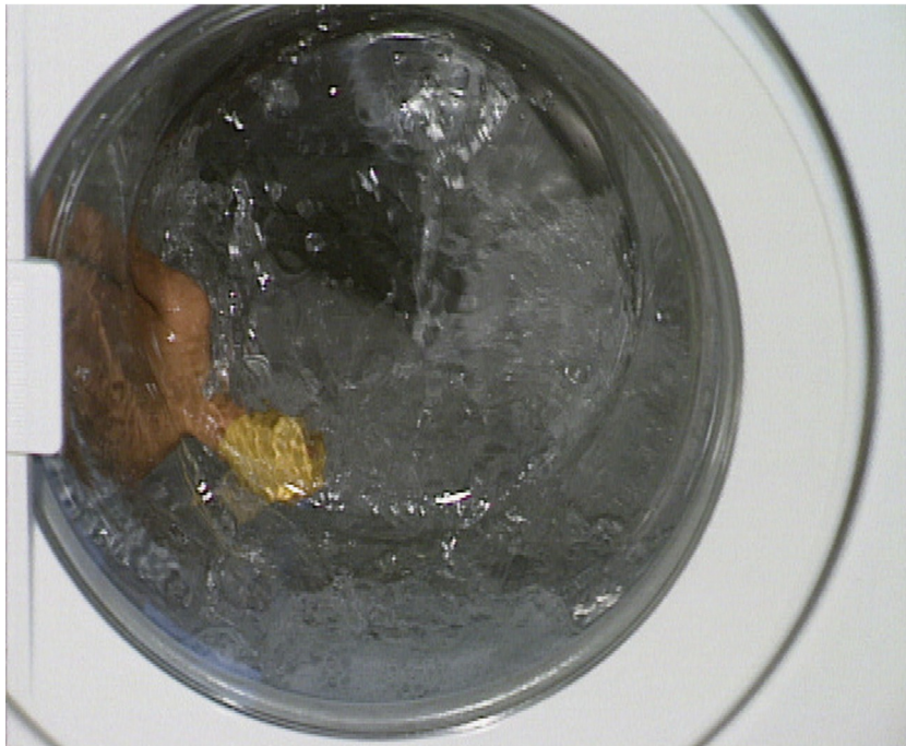
2 Grazia Toderi, Soap , 1993, still from video, DVD from Betacam SP, color, stereo sound, variable dimensions, 30'.