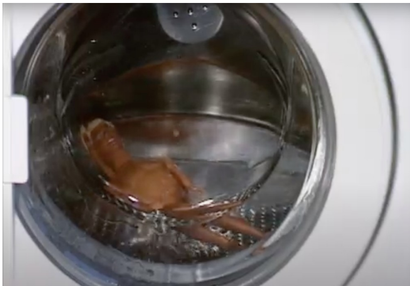
5 Grazia Toderi, Soap , 1993, still from video, DVD from Betacam SP, color, stereo sound, variable dimensions, 30'.