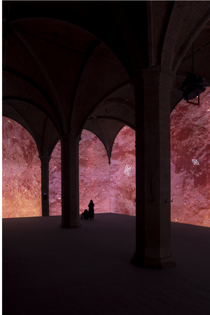
14 Grazia Toderi, Marco (I Mark) , 2019, seven video projections, loop, variable dimensions. Sala d'Arme, Palazzo Vecchio, Florence.