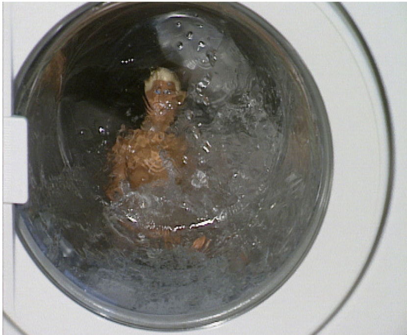
1 Grazia Toderi, Soap , 1993, still from video, DVD from Betacam SP, color, stereo sound, variable dimensions, 30'.