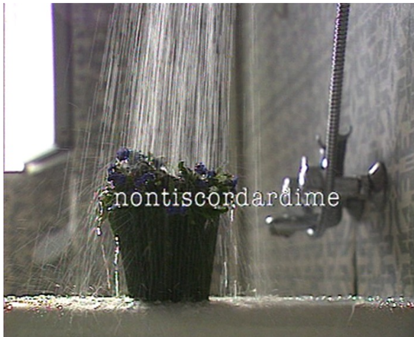
8 Grazia Toderi, Nontiscordardime (Forget-me-not) , 1993, video, loop, variable dimensions, color, stereo sound, 34'.