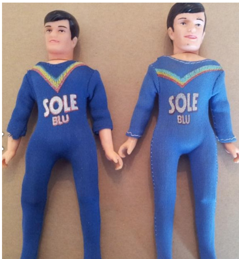
7 Sole Team Figurines, 1980s. Image available online. https://www.giocattolivecchi.com/Forum_detail.aspx?t=0&id_d=1065453&p=1 (accessed June 08, 2021).