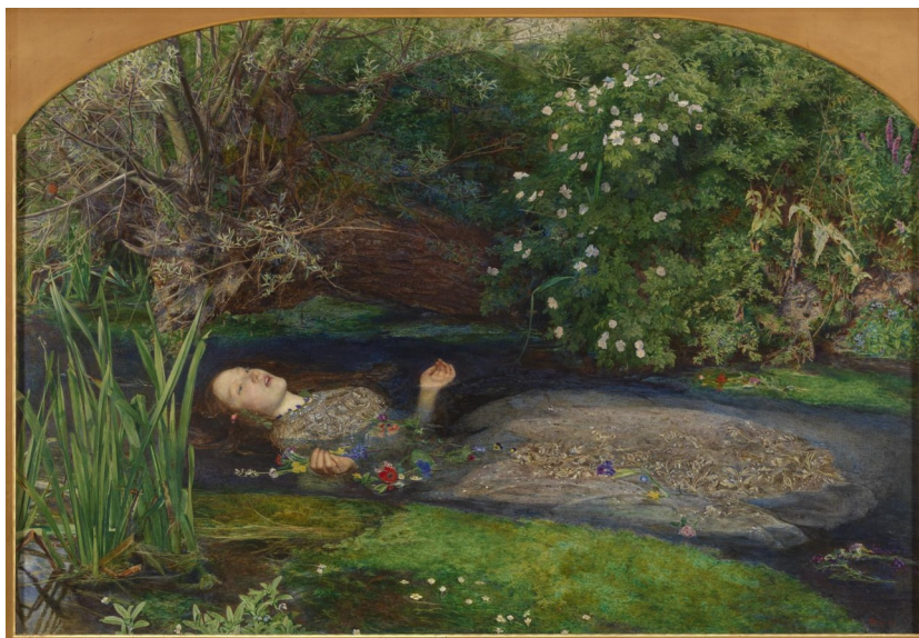
4 John Everett Millais, Ophelia , 1851-52, oil on Canvas, 76,2 × 111,8 cm. Tate Britain, London. Image released under Creative Commons https://www.tate.org.uk/art/artworks/millais-ophelia-n01506 (accessed June 08, 2021).