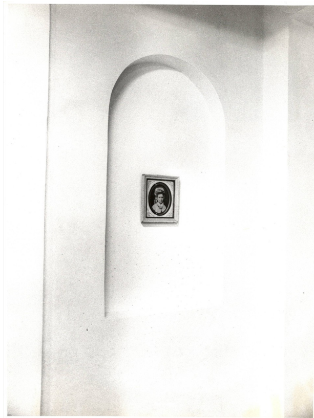
4 Carla Accardi, Origine at Cooperativa Beato Angelico (detail), 1976, photo, Archivio Accardi Sanfilippo, Rome.