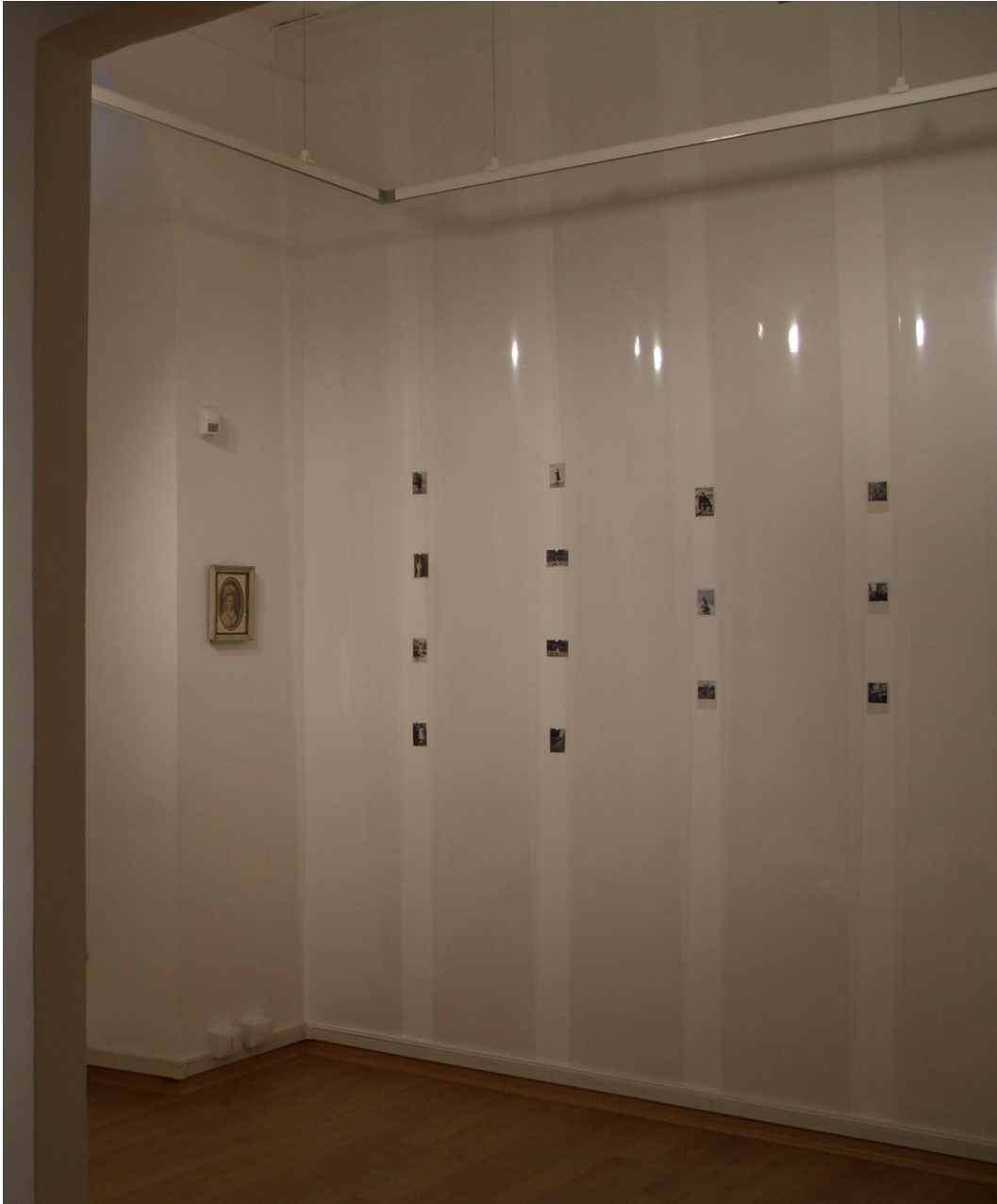
8 Carla Accardi, Origine (1976) re-installation at Cose (quasi) mai viste [Things (almost) never seen before](detail), 2007, photo, Centro di documentazione della ricerca artistica contemporanea "Luigi di Sarro", Rome.