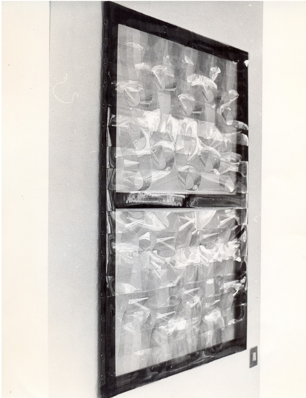
6 Carla Accardi, Trasparente , 1975, sicofoil on wood, 130 x 90 cm, collection of the artist, Rome.