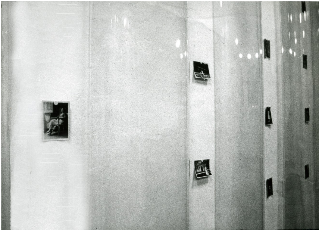
5 Carla Accardi, Origine at Cooperativa Beato Angelico (detail), 1976.