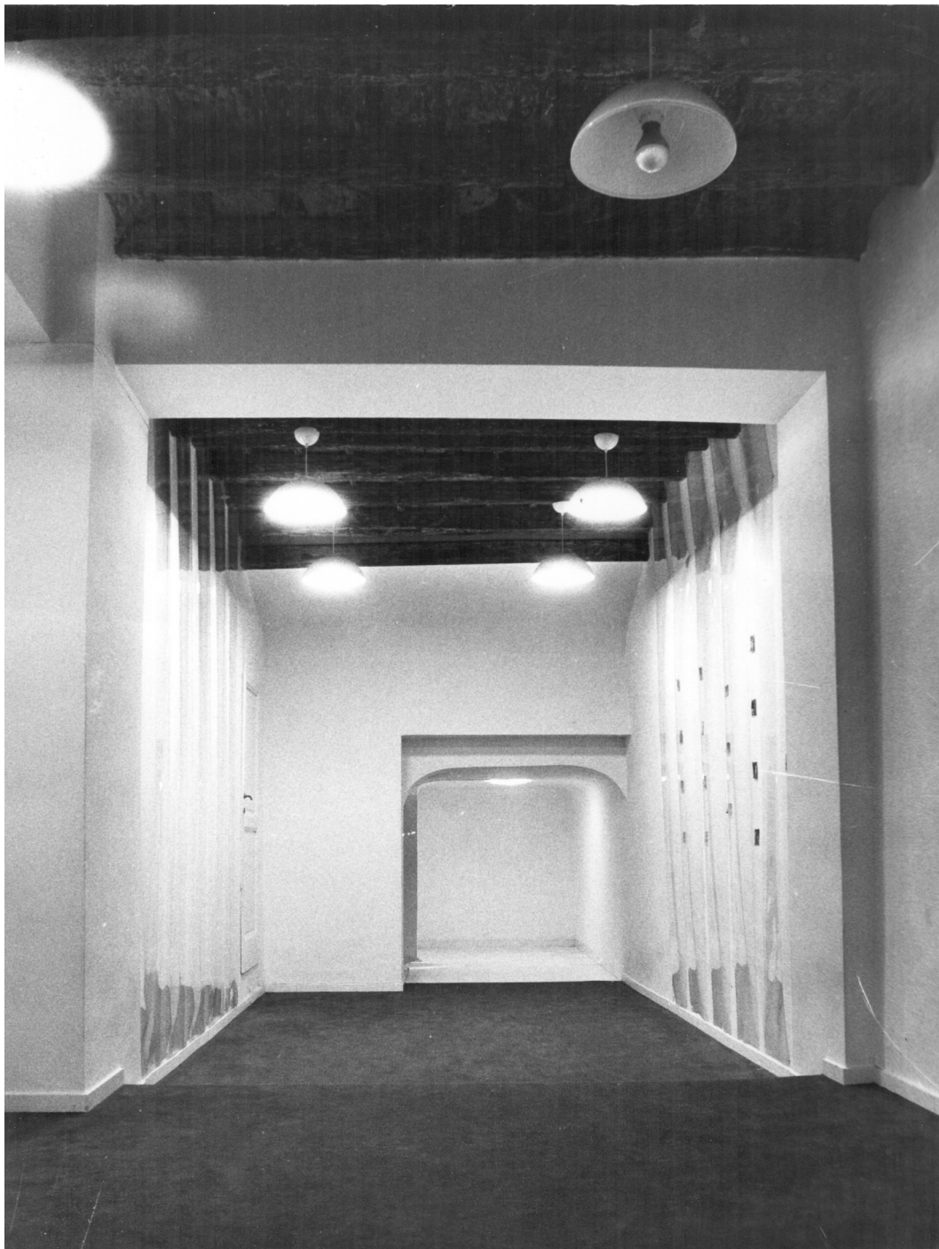
1 Carla Accardi, Origine at Cooperativa Beato Angelico, Rome, 1976, installation view, photo, Fondo Suzanne Santoro, Archivia, Casa Internazionale delle Donne, Rome.